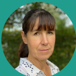
Charlotte Sellar Chair